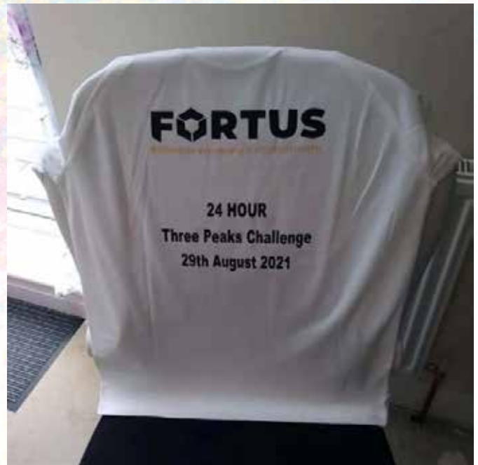
Fortus fundraised for KidsAid by taking part in the Three Peaks Challenge