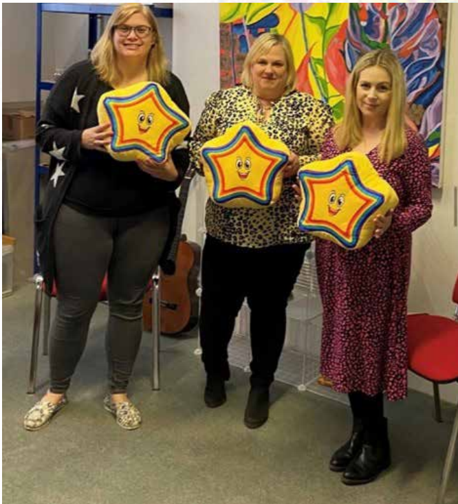
Chrysalis Foundation donated these gorgeous Star Cuddle Cushions to our therapy rooms!