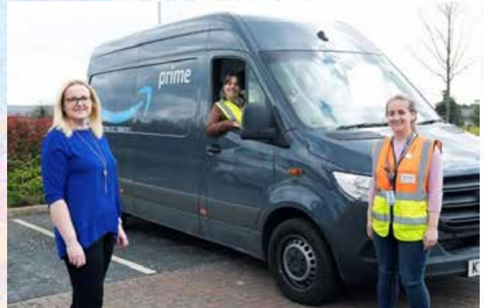
Amazon UK supported KidsAid with a total of £1500 through two donations last year!