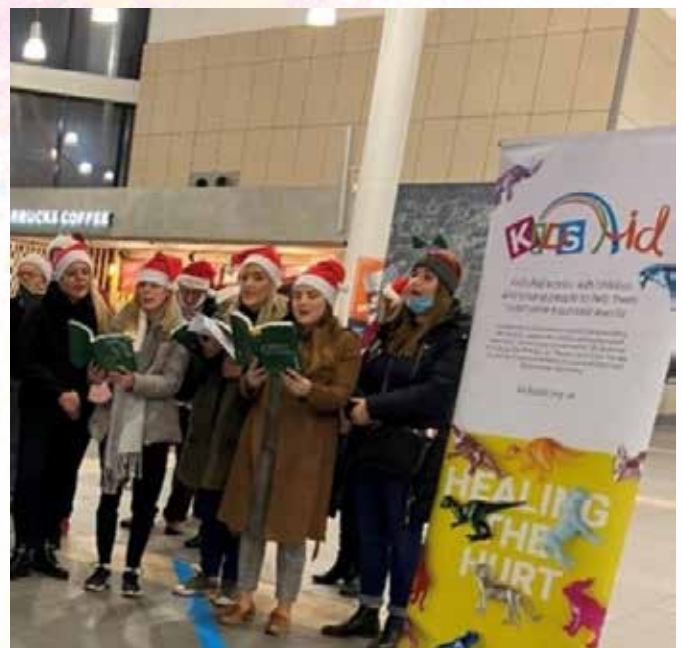
Northampton Musical Theatre Company supported us by various fundraising activities during 2021-22. They also supported some of KidsAid's families with free theatre tickets.