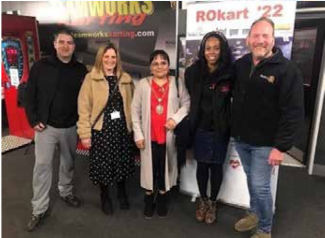
Nene Valley Rotary Club donated £1000 to KidsAid and also fundraised for us through their Rokart 22.