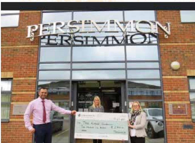
Persimmon Homes raised £2500 to support us with the work we do!