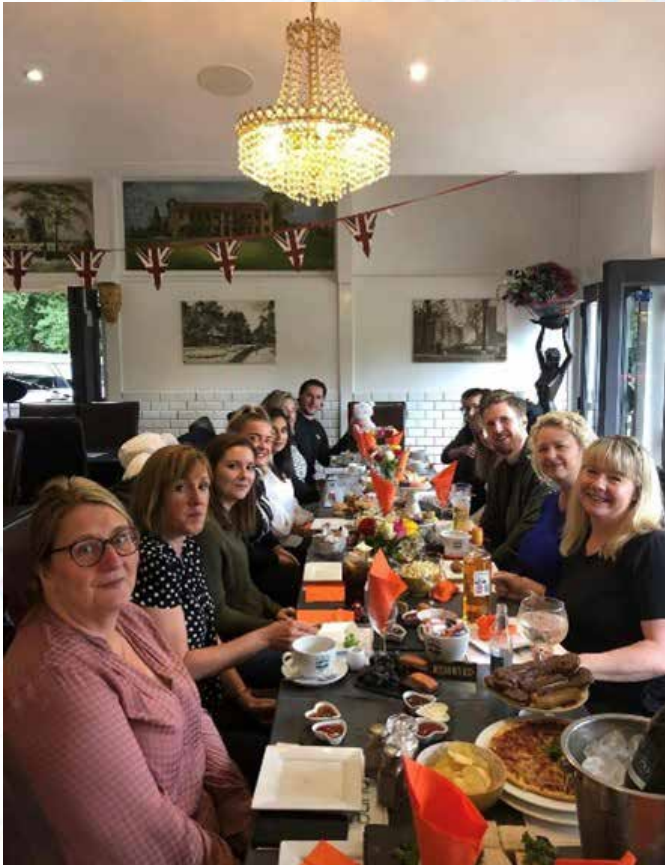
Cube Parters held a staff afternoon tea at The Park Cafe in Abington Park and raised money for us.