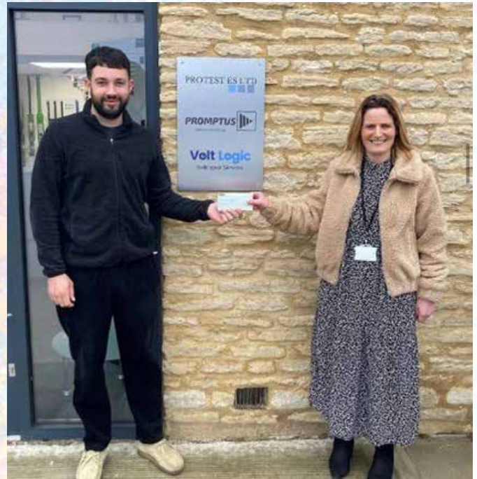
Protest Ltd started supporting us as their charity of the year!