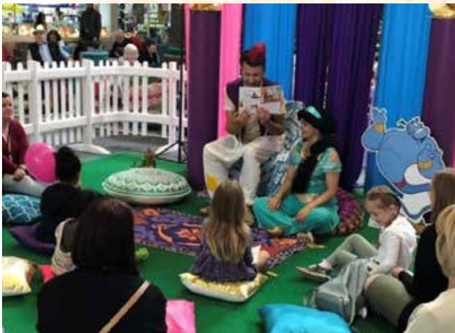
Weston Favell Shopping Centre supported KidsAid with various fundraising activities throughout 2021-22 and raised an incredible £8545 through their honesty library!